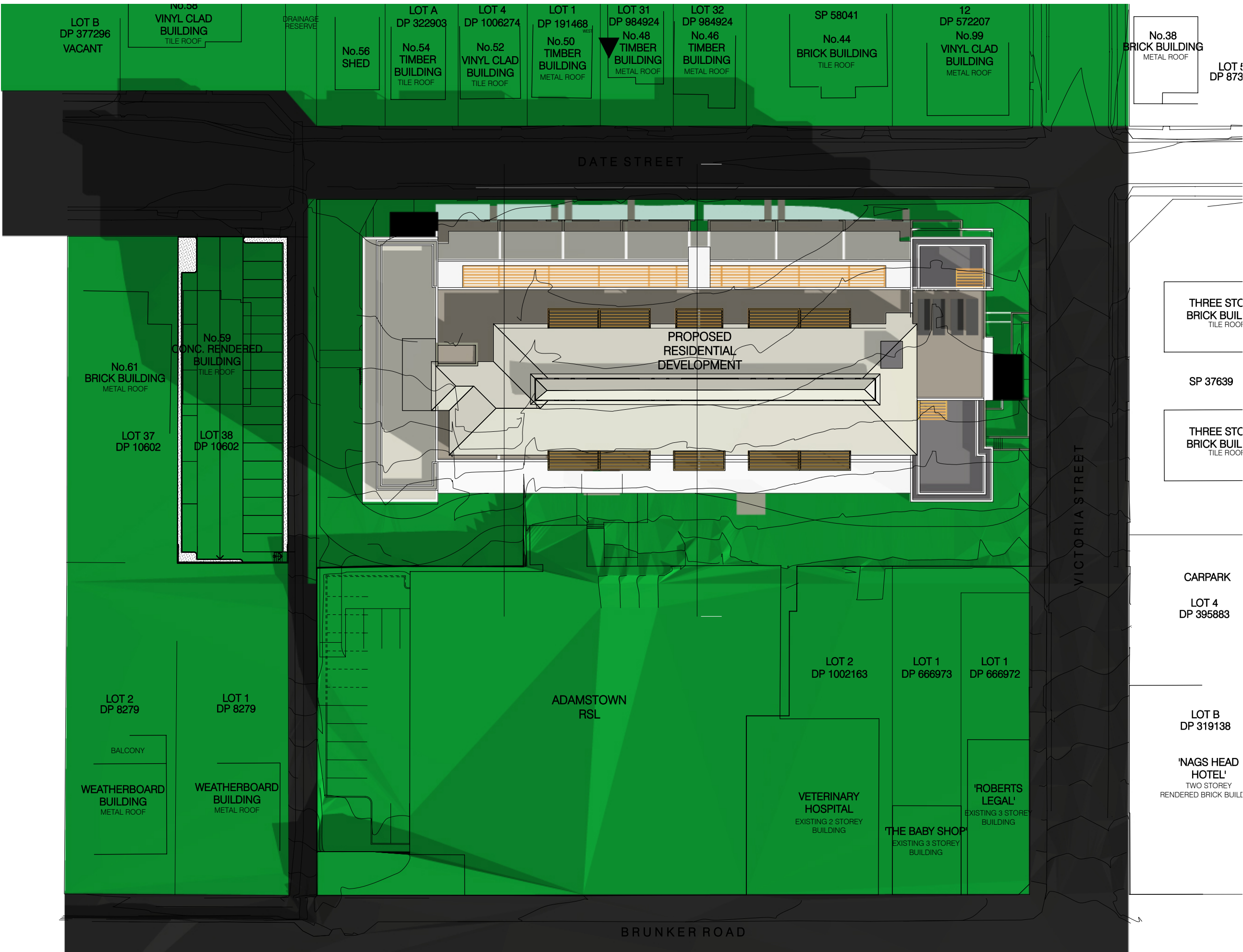
22ND JUNE 9AM SHADOW DIAGRAM