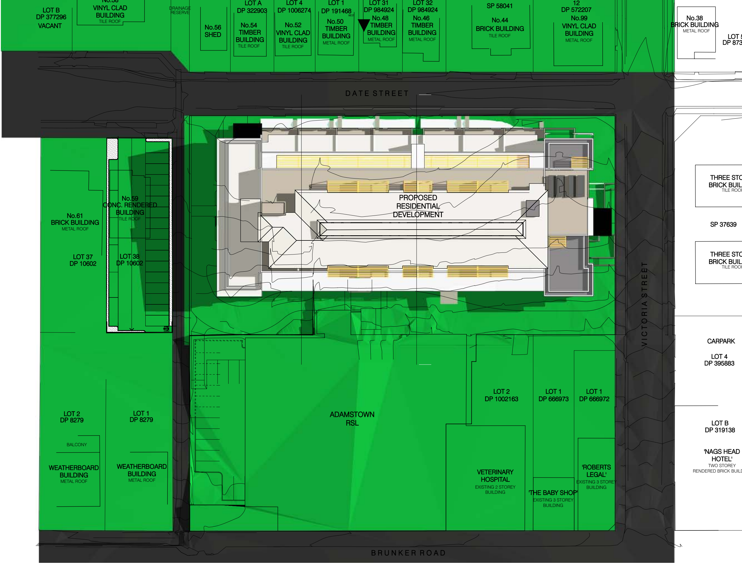
22ND JUNE 12PM SHADOW DIAGRAM